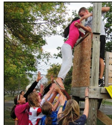
Up and over!