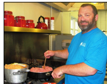
Mickey was back!